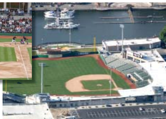
San Joaquin County offers a variety of outdoor recreation opportunities.