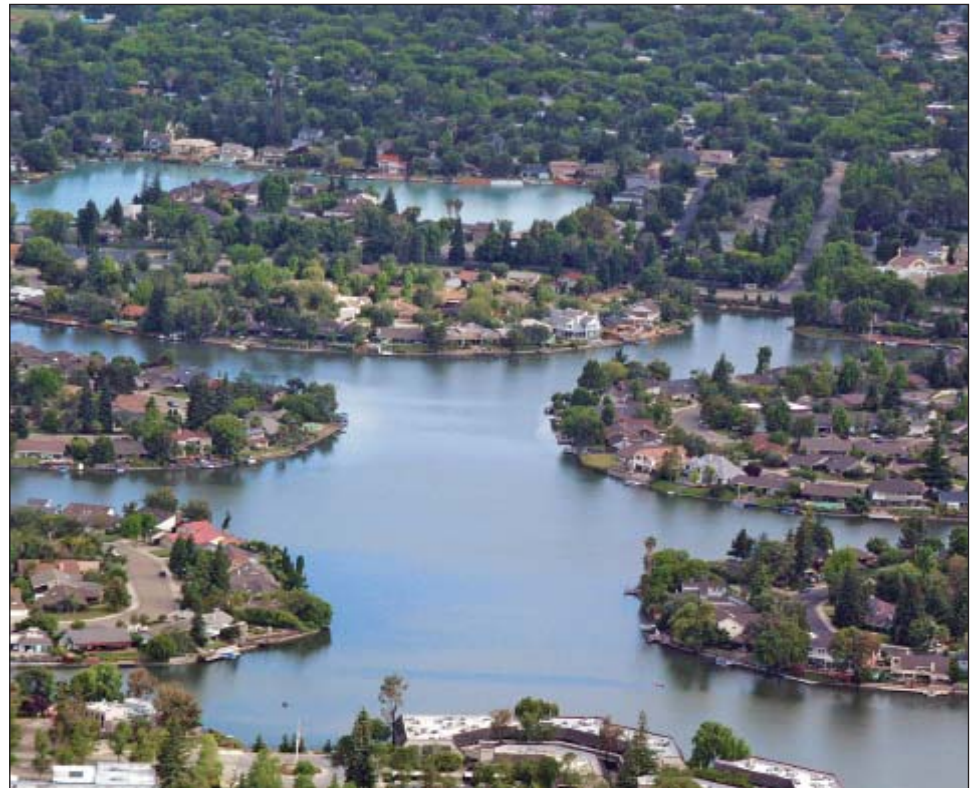
From luxurious executive homes to starter homes, San Joaquin County offers a range of choices to suit individual life styles.